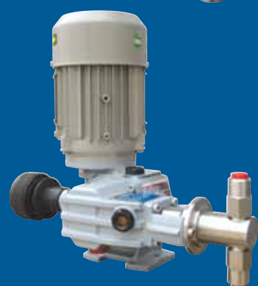
Pump type RCN 6A 70 TL

These pumps are designed to handle EXTREMELY LOW FLOW RATES where continuous dosing is required. These packed plunger pumps are able to control down to addition levels of 15 ml/h (0.04 GPH) at a maximum pressure of 40 bar g (600 PSI g) due to the unique OBL packed plunger design and the use of exotic materials for valves components.