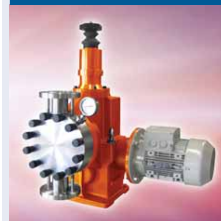
XLC API 675