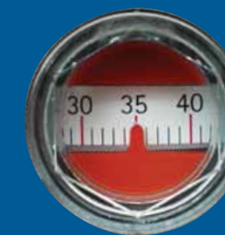
Detail of Analogical reading (1% steps).