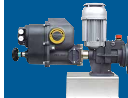
Z type actuator horizontally fitted on XRN pump (hydraulic diaphragm).