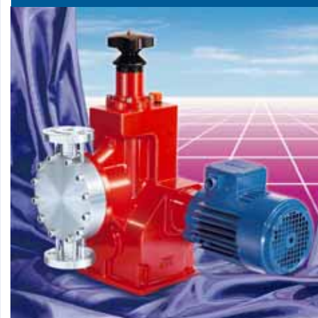
XL-XLB API 675