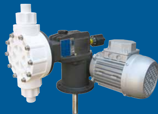
Pump type MHBN100 PP

OBL is a world leader in the manufacture of metering pumps for FILTER AIDS , used for wine, beer and fruit juice filtration. These are diatomaceous earths known as Kieselgur. A range of pumps is available including lip seal plunger pump, mechanical diaphragm and hydraulically actuated diaphragm. These meet the general requirements for flow rates and pressure (100 litres per hour, 26,5 GPH at 10 bar g, 145 PSI g).