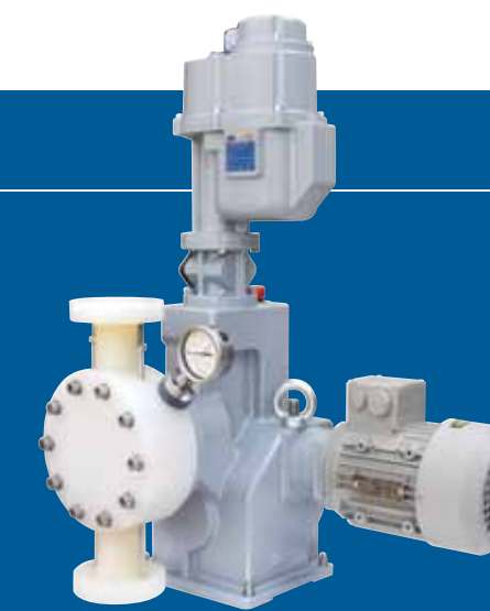
Z type actuator vertically fitted on XL pump (hydraulic diaphragm to API 675 STD).