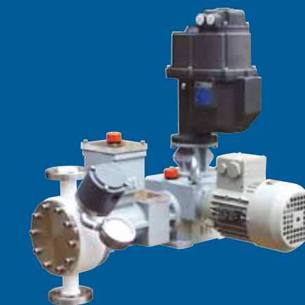
Z type actuator vertically fitted on LX9 pump (hydraulic diaphragm to API 675 STD).