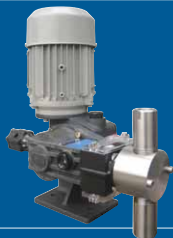
Pump type RCC 16 HV 50 DV

Specifically designed to handle high VISCOSITY PRODUCTS the HV pumps are available in packed plunger version only with either spring or positive return mechanisms. These pumps are capable of handling products with a viscosity up to 55,000 cP with each head capable of achieving flow rates of up to 150 l/h (40 GPH).